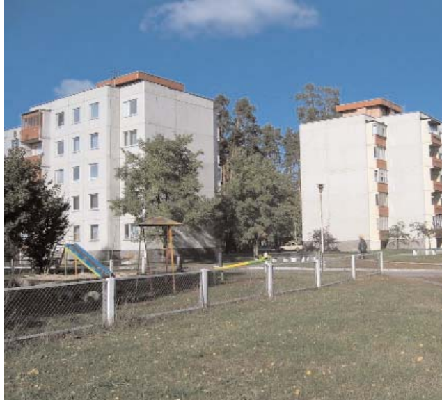
The new town of Slavutich, built in the aftermath of the accident.

The 30-kilometre exclusion zone around the site of the accident is also referred to as the Zone of Alienation, the Chernobyl Zone, the Zone of Exclusion or The Fourth Zone. Administratively, it includes northernmost parts of Kyivska Oblast and Zhytomyrska Oblast of Ukraine, and adjoins the country's border with Belarus. The zone was established soon after the accident in order to evacuate the local population and to prevent people from entering heavily contaminated territory. The area adjoining the site of the disaster was divided into four concentric zones, among them the fourth (actually the nearest, within a radius of 30 kilometres) being the most dangerous. Any residence, civil or business activities within the zone are prohibited by law.