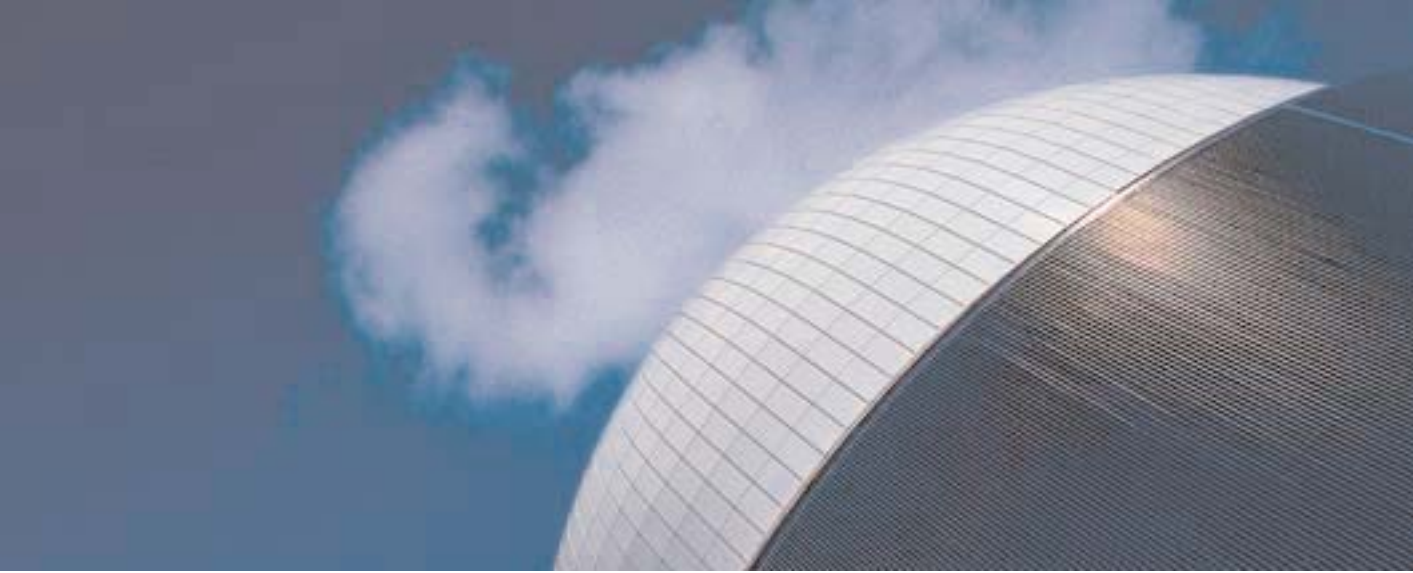
Nuclear power plants in the west use a 'defence in depth' approach with multiple safety systems. Pictured is the reactor containment building at Sizewell B, England.